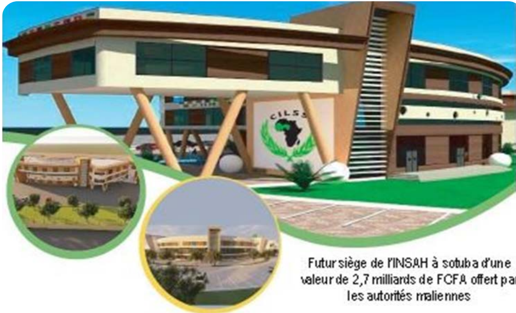
Futur siège de l'INSAH à Sotuba d'une valeur de 2,7 milliards de FCFA offert par les autorités maliennes

Les politiques et instruments régionaux sur le commerce des produits agro-sylvo-pastoraux et halieutiques sont mieux appliqués et plus incitatifs